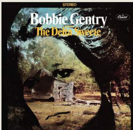
BOBBIE GENTRY The Delta Sweete [Expanded Edition]

I notice that I suggest using Qobuz or Tidal quite frequently for checking albums out: I wish I did as I recommend – that way I might not buy so many duffers.