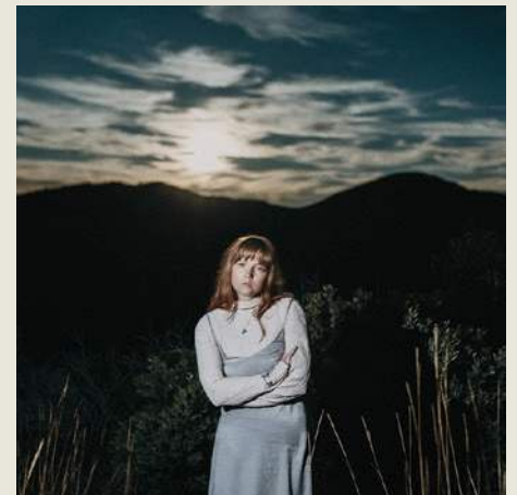
COURTNEY MARIE ANDREWS Old Flowers

It's up to you to pick between download or the vinyl. Personally, I prefer the sound of the records, but then they do come with a mid-album break – and thus possibly a trance-break – which the download doesn't.