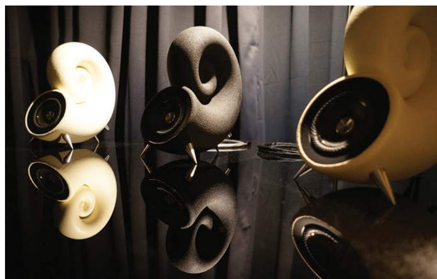
Deeptime Spirula, turning sand into sound