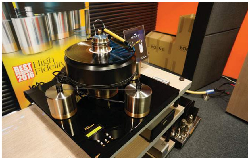
J. Sikora Reference Line turntable with Kevlar 12 arm