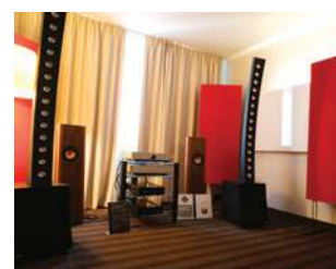
No lens distortion but Audio Alto's curvy AA LA17 OB MKII sound projector