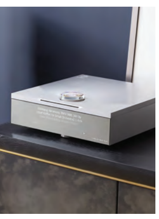
Linn: the world's best streamer?