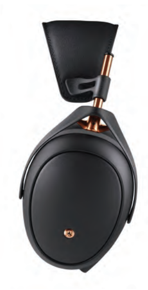
Meze Audio's Liric: closed-back planar magnetic headphones