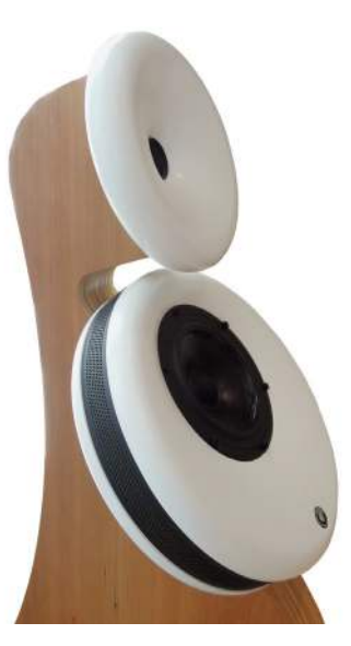
Gradient's Helsinki on page 7

Chris Bryant tries four affordable cartrdges on page 26