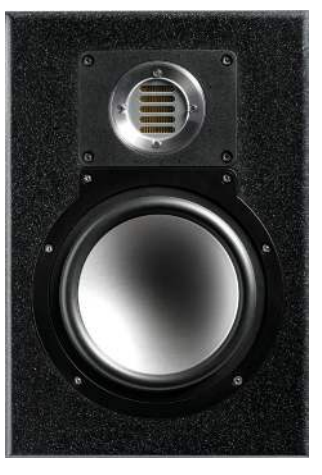
Rafael Todes tries this compact active speaker on page 40