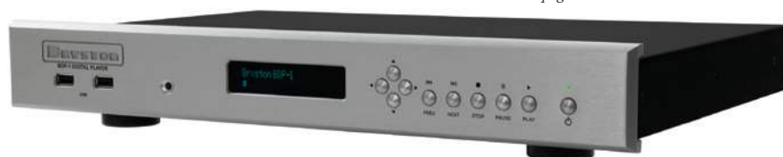
Bryston's BDP1 - a true audio computer? See page 30