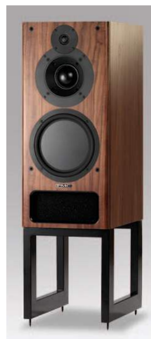
The PMC IB2i gets the full critical Colloms treatment on page 20