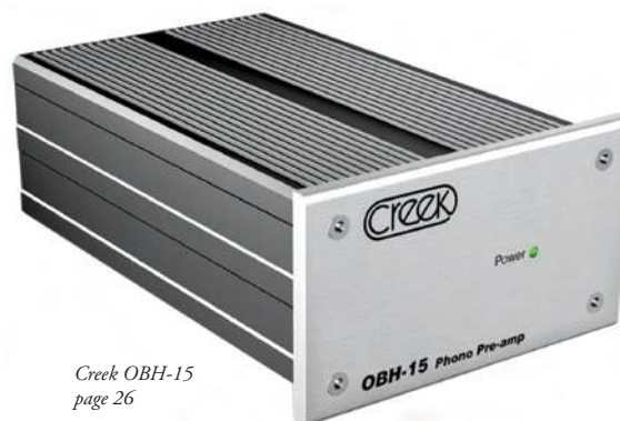
Creek OBH-15 page 26

Peter Thomas challenges the myth that simple crossovers are a good thing