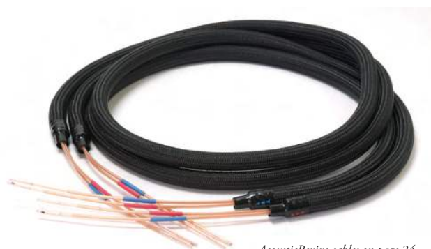
AcousticRevive cables on page 24